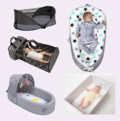
Items marketed for sleep for infants up to 5 months of age (bassinets, in-bed sleepers, etc), item must have a stand & sides over 7.5 inches high.