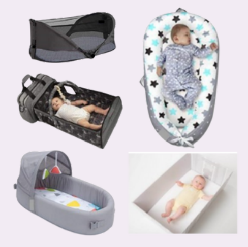
Items marketed for sleep for infants up to 5 months of age (bassinets, in-bed sleepers, etc), item must have a stand & sides over 7.5 inches high.